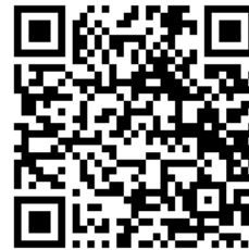
SportsYou Registration QR Code